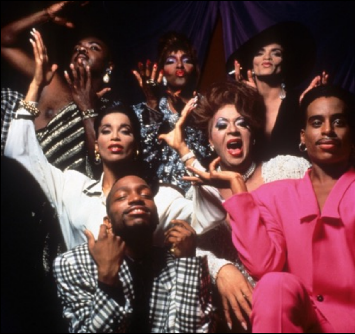
Paris Is Burning 1990 Jennie Livingston