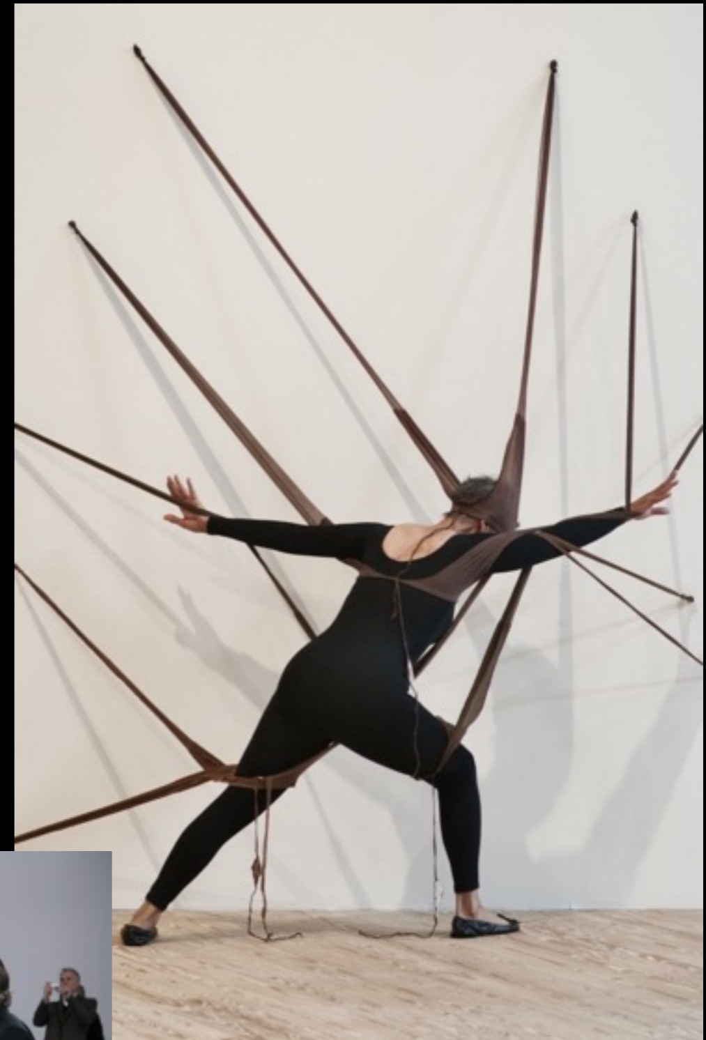
RSVP 2013 Senga Nengudi