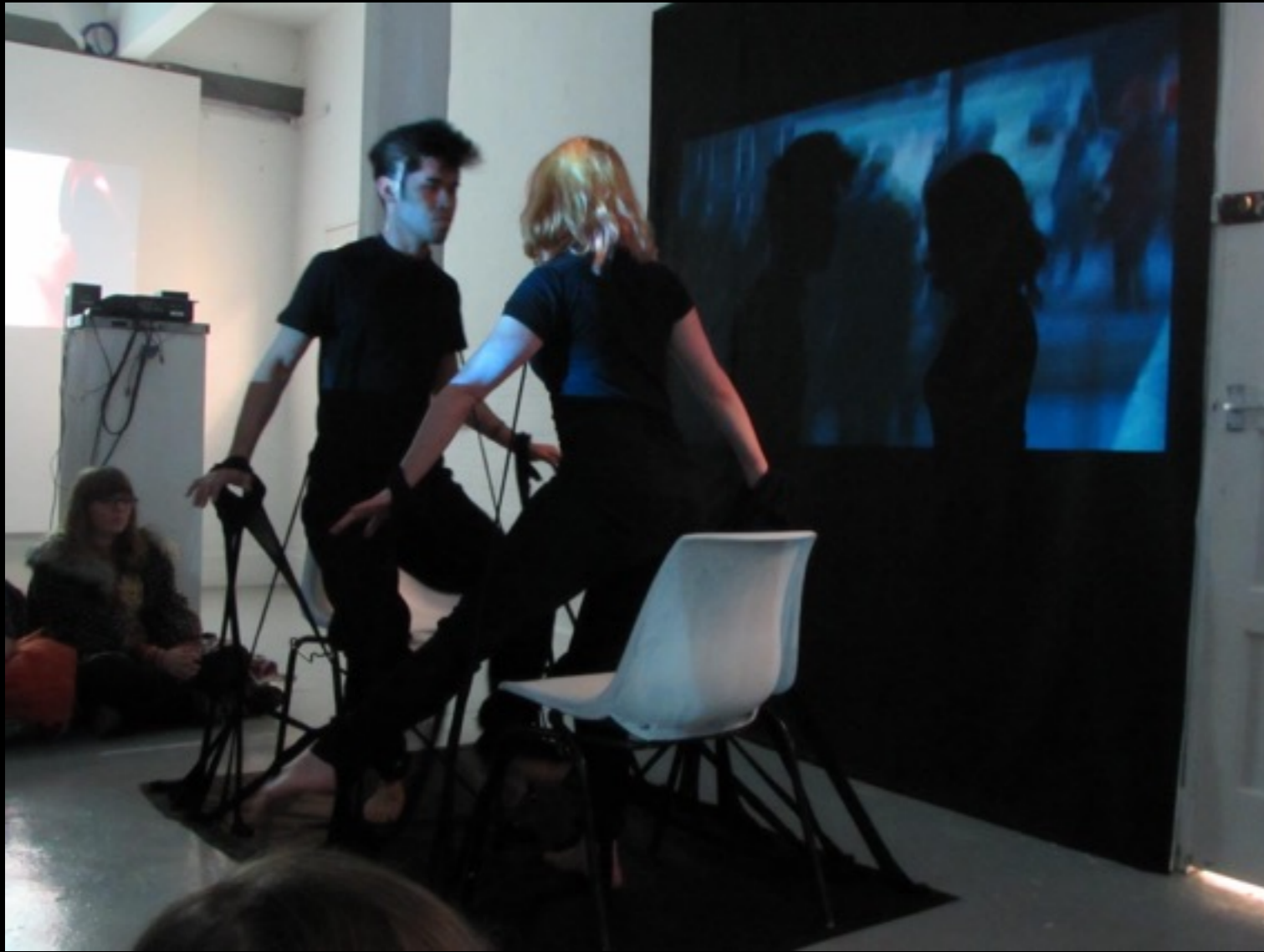
The Artist Is Present 2014 Marina Abramovic